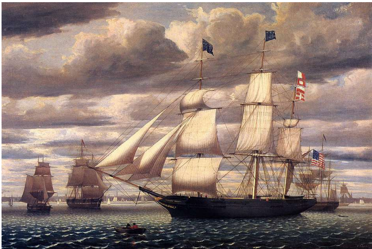
Fitz Hugh Lane (1804-1865): Clipper Ship "Southern Cross" Leaving Boston Harbor , 1851

Vallipo - Valparaiso, port in Chile (= Val-i-paraiso)