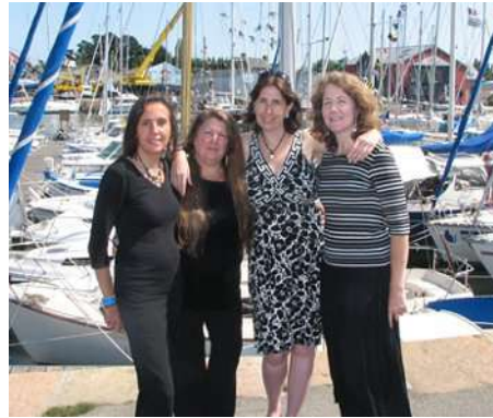
The Johnson Girls - an all-female shanty group, named after the above shanty. from www.thejohnsongirls.com

Archive of Folk Culture , The American Folklife Center of the Library of Congress, Washington