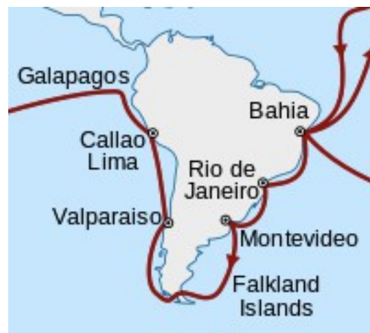
Map of South America showing Callao and Valparaiso (Vallipo)

Part of a map at www.sacredearth-travel.com "In Darwin's Footsteps ... voyage of the Beagle".