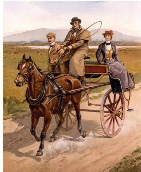
Irish jaunting car, 1890-1900 colour

Jaunting car - a light two-wheeled carriage for a single horse, commonly with seats placed back to back and the foot-boards projecting over the wheels; once the typical conveyance for persons in Ireland.