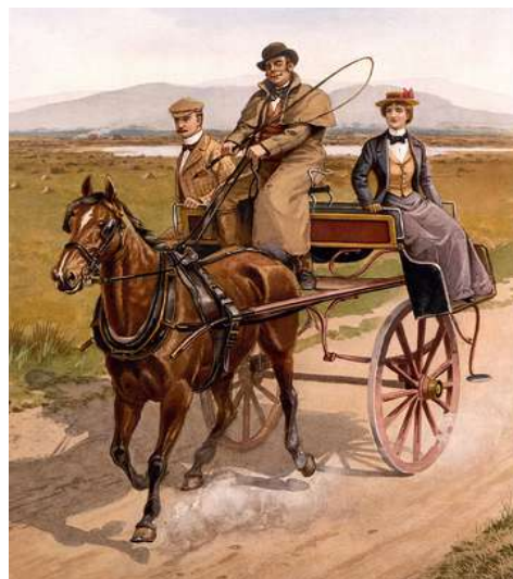
Irish jaunting car, 1890-1900 colour Photochrom print

Jaunting car - a light two-wheeled carriage for a single horse, commonly with seats placed back to back and the foot-boards projecting over the wheels; once the typical conveyance for persons in Ireland.