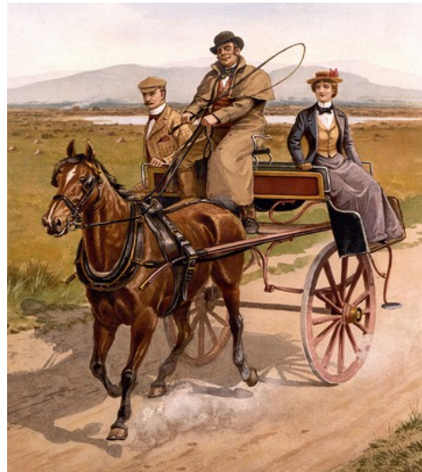
Irish jaunting car, 1890-1900 colour Photochrom print

Jaunting car - a light two-wheeled carriage for a single horse, commonly with seats placed back to back and the foot-boards projecting over the wheels; once the typical conveyance for persons in Ireland.